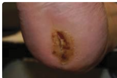
Week 2 Prior to 2 nd Application. 60% Reduction