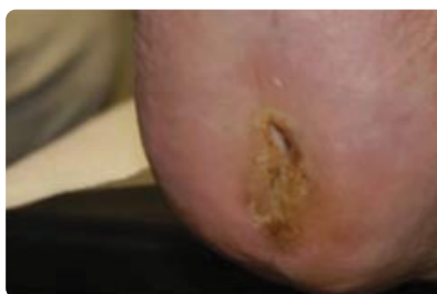
Week 4. 80% Reduction