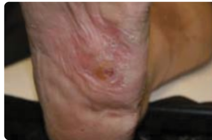
Week 4. 100% Reduction