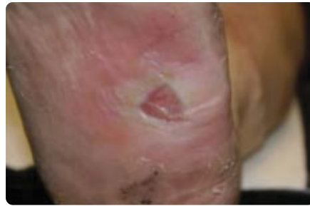
Day of 1 st Application