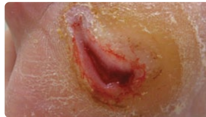
Day 7: After 1 Excellagen Treatment (0.9 cm 2 )