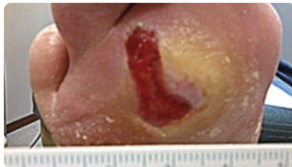
Prior to Treatment 2.5 cm 2