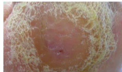
Day 75: After 8 Excellagen Treatments. Wound Healed