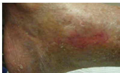
Week 9 (0.6 cm 2 )