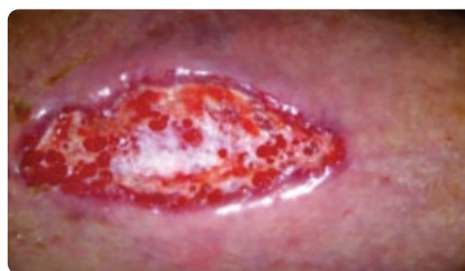
Week 4 Wound Fully Granulated