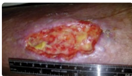
Pre-Treatment (16.2 cm 2 ) Wound Extends to Fascia