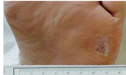
Day 63: After Five Applications of Excellagen

Excellagen applied biweekly, following debridement