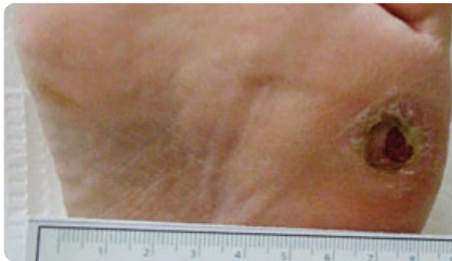
Day 42: After Three Applications of Excellagen