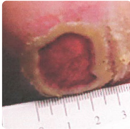
5/21/12: Wound Area 3.5 cm 2 Sharp debridement followed by Excellagen Application

“Noticed healing accelerated after first week – I was pleasantly surprised. I’m very pleased” – Dr. Curtis Long, DPM